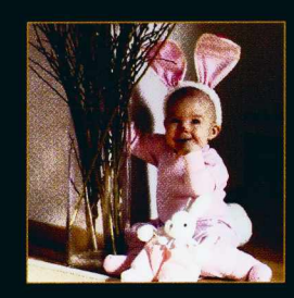
"Don't be afraid to try something new. It helps you know more about yourself."

"She grabbed her favorite pair of shoes and she went off to conquer the world" -unknown