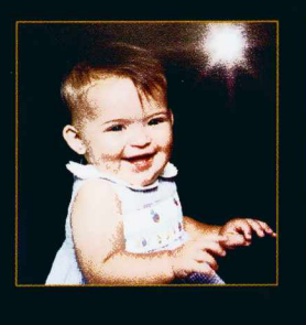
"You can't regret what you don't remember."