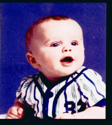
"You have brains in your head. You have feet in your shoes. You can steer yourself any direction you choose." -Dr. Seuss